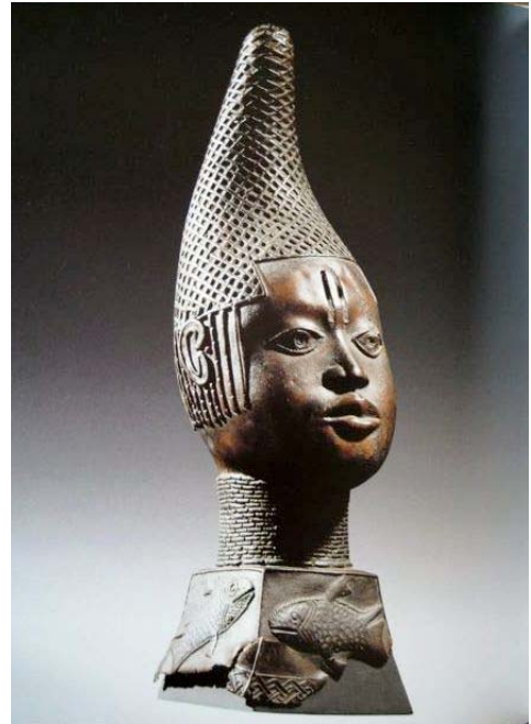
Queen Mother Idia, Ethnologisches Museum, Berlin.